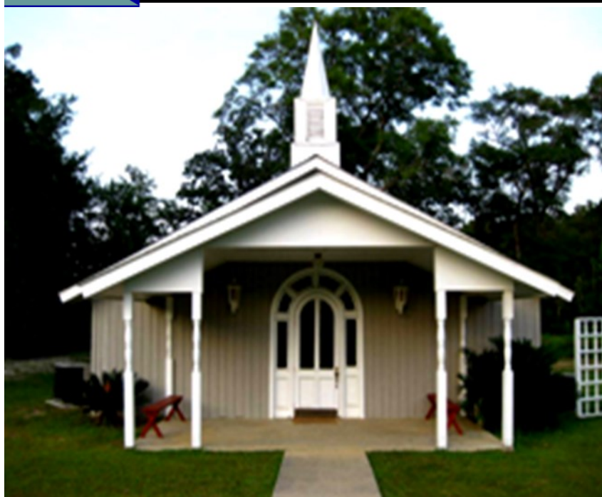
CHAPEL AT CAMP JACKSON