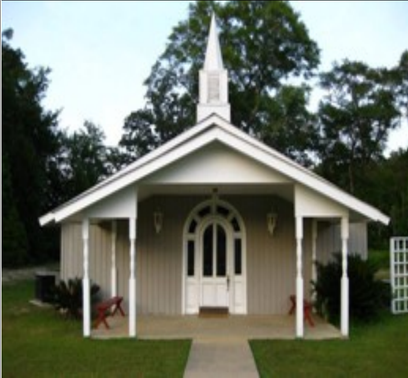
CHAPEL AT CAMP JACKSON